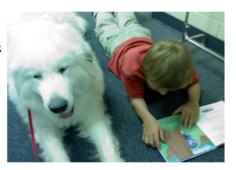
or on him....