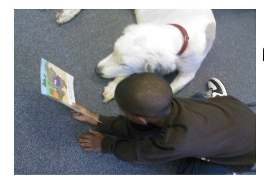
Kids can lay beside him....